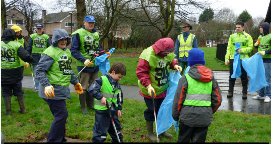
Milverton residents and councillors set to work cleaning up

The Milverton Community litter pick the other week was a great success despite the rain.